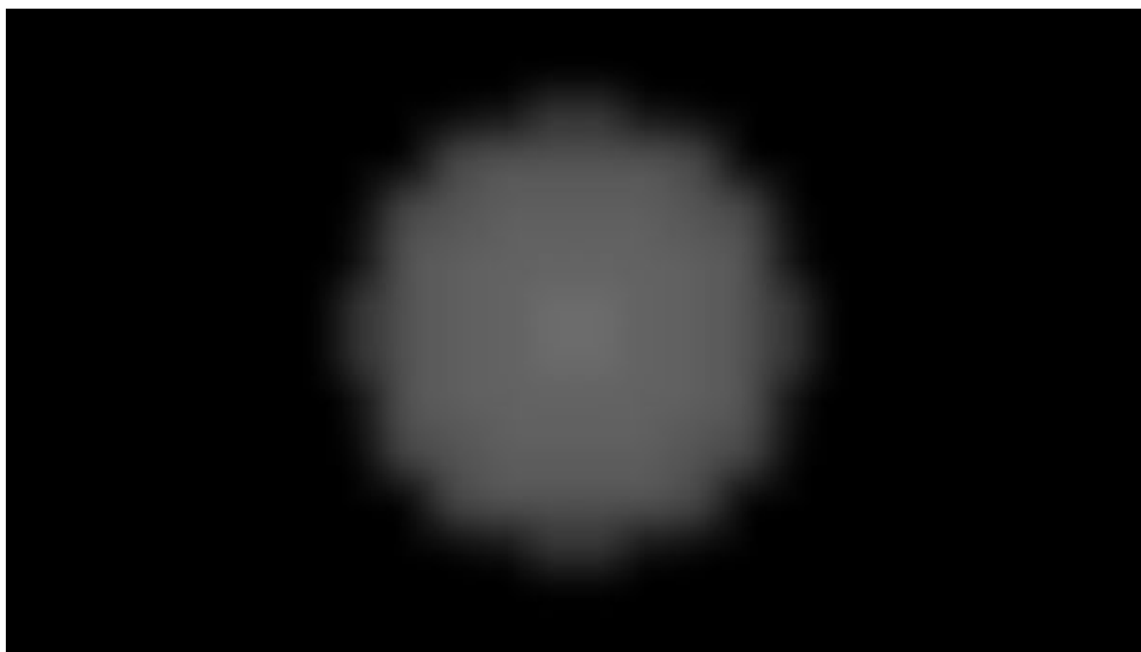
Implicit sphere, with the density sampled to a very coarse grid